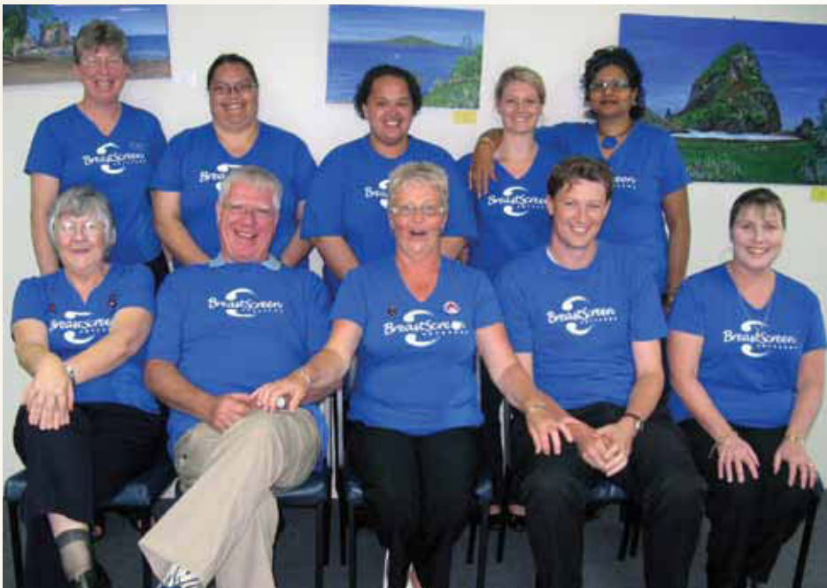
Westview Medical Centre staff wear their BreastScreening t-shirts at work and on the netball courts

The MOU was initiated by Te Whanau O Waipareira Trust with the hope of working collaboratively rather than competitively. All three organisations are working closer together to ensure whanau with mental health issues are looked after no matter what their situation is.