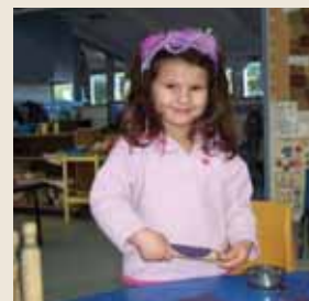
The B4 School Check programme will check the health of your 4-year-old to make sure they are ready to start school.

have the resources to deliver the checks at their own clinics, mobile nurses are available to give home checks.